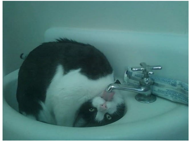
Rings 1 and 2 double specialty and all breeds Sue Ford (NZCF) All Exhibits