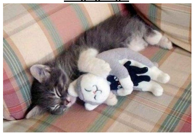
Rings 3 and 4 double specialty and all breeds Roy Griffiths (NZCF) All Exhibits